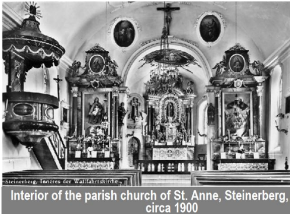
Steinerberg, Innkreis der Wallfahrtskirche Interior of the parish church of St. Anne, Steinerberg, circa 1900

Perpetual adoration began on January 1, 1846. The sisters prayed by day in the church. All the sisters came to church where they sang a hymn of praise and knelt in adoration. They prayed the Rosary of the Precious Blood and the Seven Offerings. They received Holy Communion before Mass and then attended the Mass. After more silent prayers all but two of the sisters returned to the convent. All day a pair of sisters would come to the church, hour by hour, for a period of prayer until 8:00 in the evening.