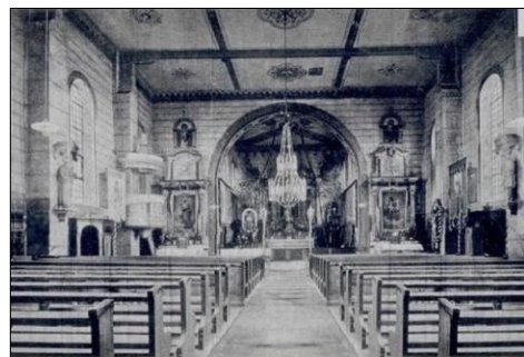
Niederwühl, parish church, interior view with altar http://img.istocking.net/7580/16632839/0/n/5595282/Alt-Niederwühl-Pfarrkirche-innenansicht-mit-Altar.jpg

By SEPTEMBER 8, 1845 , Ursula Behringer and the young women from Glottertal, the core of the new community, had set up convent life in the sexton's house/inn/tavern→