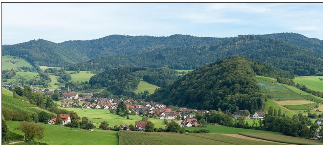
View of Glottertal from the northwest. The parish church of St. Blaise is at the far left.