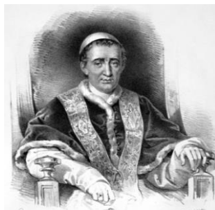
Portrait of Pope Gregory XVI (1765-1846) Date 1831