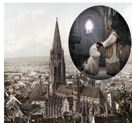
Freiburg Cathedral Insert Freiburg Cathedral interior Bishop & priest