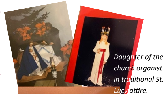
Daughter of the church organist in traditional St. Lucy attire.