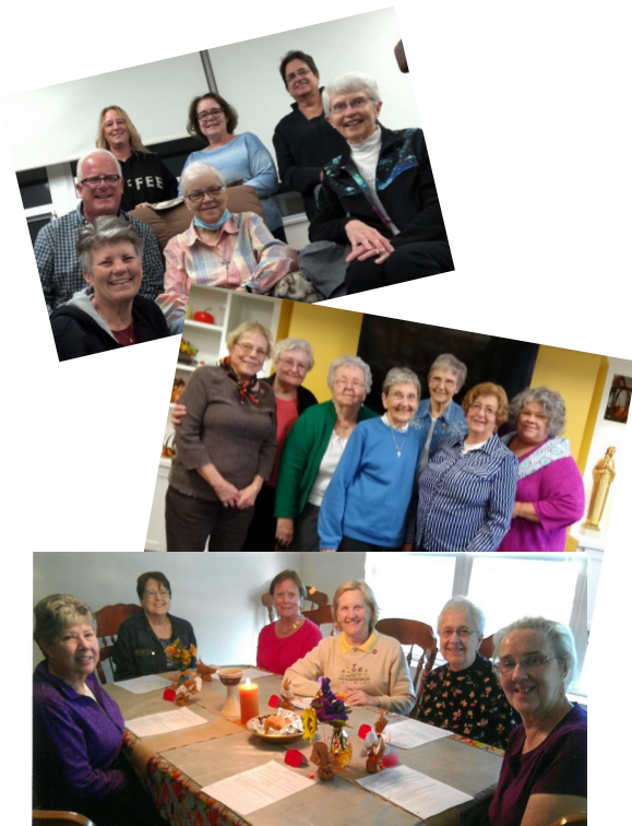
From top to bottom, members of Mustard Seeds, In His Footsteps, and Wisdom Circle Small Faith Communities at gatherings.