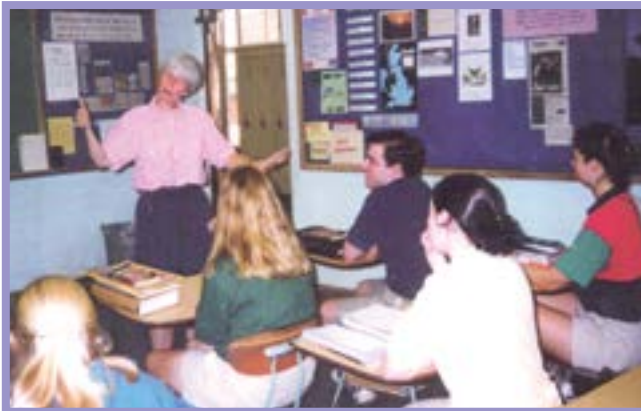
Teaching at Bishop DuBourg.