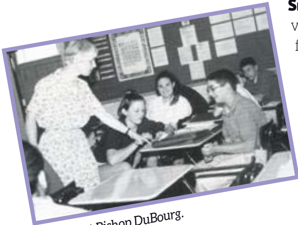
Teaching at Bishop DuBourg.