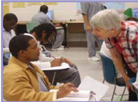
Education though Prison Ministry.